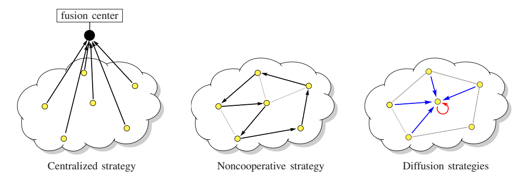
Fig. 1. Illustration of information processing within the proposed strategies for PCA in WSNs. The right-hand scheme illustrates both diffusion strategies: combine-then-adapt and adapt-then-combine.